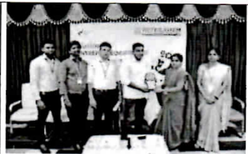
Poster sample & Collage Photo