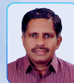
ABRAHAM SUBARAJ. M

The corrosion rate of b4c particles reinforced with Al-Si alloy prepared by powder metallurgy in acidic solution using RSM