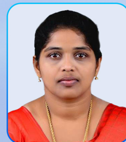
C. EMMY PREMA

Local Binary Pattern based Hybrid Texture Descriptors for the classification of Smoke Images